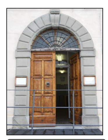
Welcome to Casa Tomasetti

"Let the little children come to me, and do not stop them; for it is to such as these that the Kingdom of Heaven belongs." Luke 18:16-17