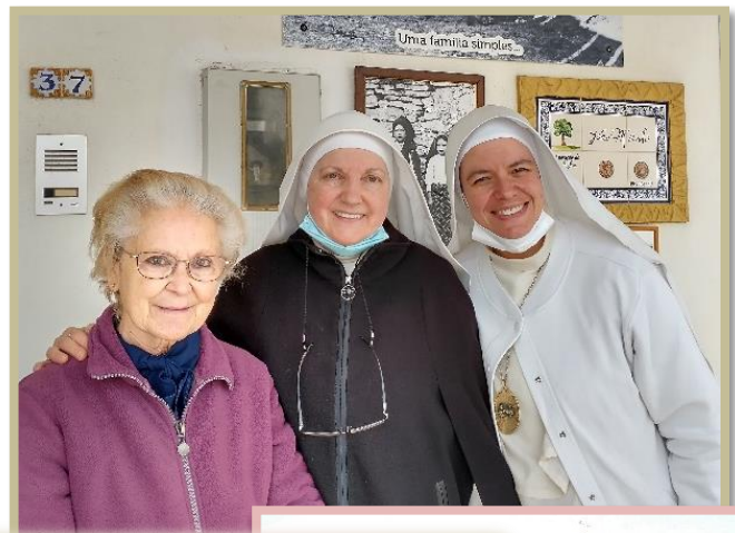
Meeting the cousin of Sts. Francisco and Jacinta outside of their childhood home.