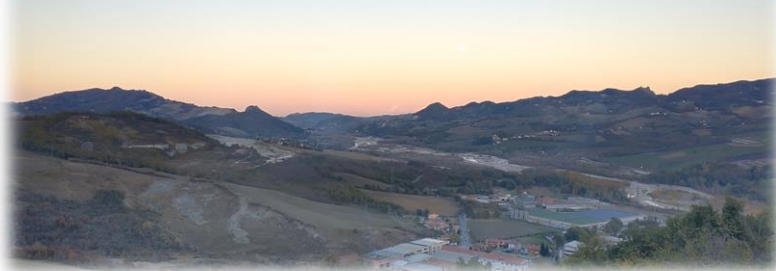
The view from our kitchen window

With our groundbreaking move to the United States, the rest of us here in Europe must adapt with change as well. Our numbers