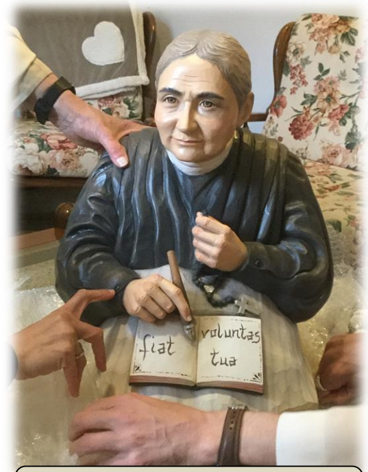
A not so little surprise from two dear friends and generous benefactors.