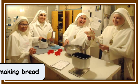
Having fun making bread

From early on, Our Lady of Medugorje has been urging Her children to fast on bread and water every Wednesday and Friday, assuring us that it could stop wars and win back souls that Satan is leading on the path to perdition. Yet it’s probably one of our heavenly Mother’s requests that we just don’t take seriously enough. Yes, it’s difficult. You get hungry, feel tired, maybe experience some headaches, or just get plain sick of the same boring flavors all day long. But the martyrs were willing to suffer atrocious pains and sacrifice their very lives for love of Christ and His Church. For those of us in good health, are we not even willing to suffer a little discomfort and sacrifice a few pleasures?